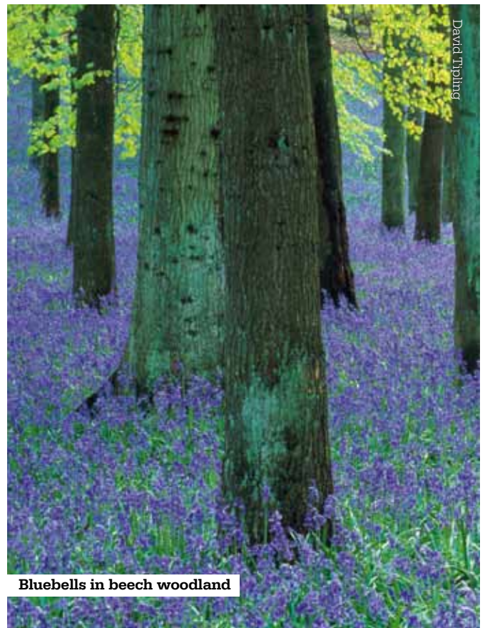
Bluebells in beech woodland

Many of the government's biodiversity indicators show downward trends, particularly over the longer term.