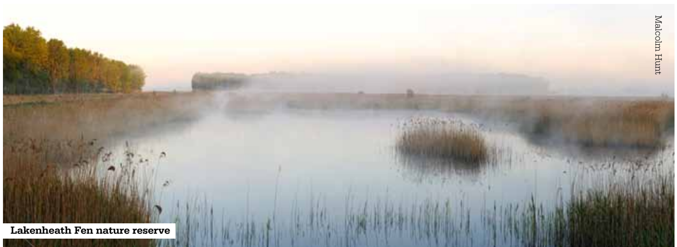
Lakenheath Fen nature reserve

At least 700 hectares of reedbed have been recreated in the last 20 years 24 , as well as large new wetland systems, and more are planned. Most of these are inland, secure from the danger of saline incursion due to sea level rise, which threatens precious sites around the East Anglian coast. Bittern numbers, down to just 11 booming males in 1997, topped 100 in 2011 for the first time since records began, thanks to a spread of new sites across England – an indication of how new reedbeds are helping nature to thrive.