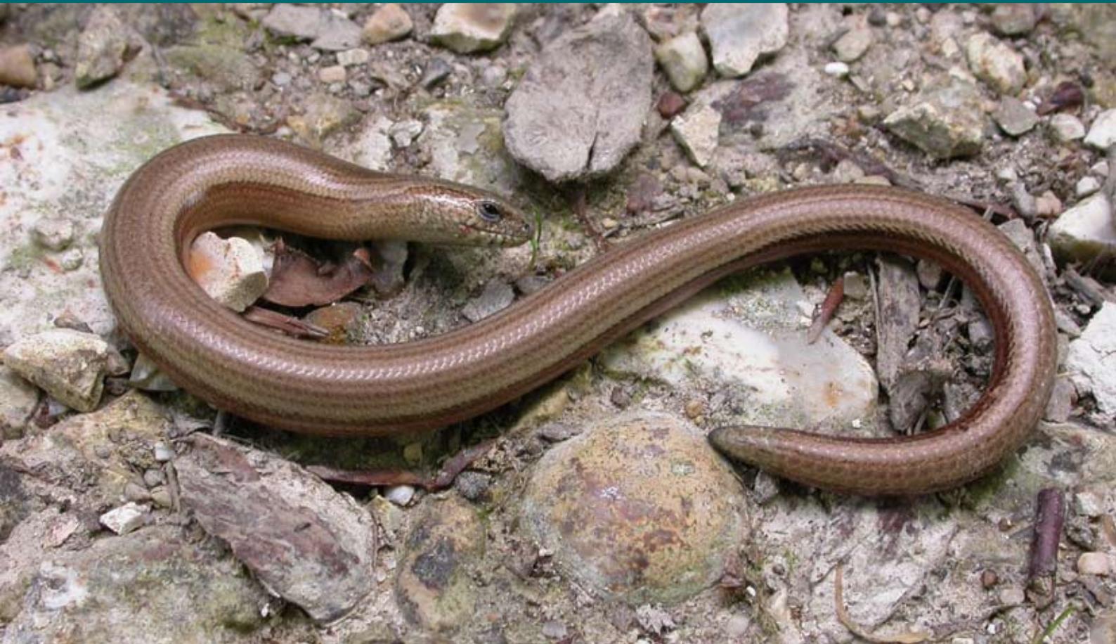
Slow-worm by Mike Toms

A lthough amphibians and reptiles belong to two different taxonomic classes, they are often lumped together. Together they share some ecological similarities and may even look superficially similar. Some are familiar garden inhabitants, others less so. Being able to identify the different species can help Garden BirdWatchers to accurately record those species using their gardens and may also reassure those who might be worried by the appearance of a snake.